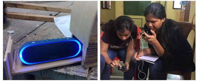
Figure 2. The “back-end” of the deployed system. Left: the inside of the prototype, showing the Bluetooth speaker concealed inside. Right: the “wizards” on the other end of the phone line, listening for questions, looking up answers and responding in a conversational system-like manner.

We used a Wizard-of-Oz method [17] to create the prototype. The device was a wooden box with “Ask Google a question” stencilled on the front of its casing (see Fig. 3). Inside the box was a battery-powered Bluetooth hands-free speaker and microphone kit (see Fig. 2, left). During the deployment, this kit was connected to the mobile phone of a local researcher standing nearby. To activate the system, the researcher initiated a phone call. All audio output from this phone call was audible