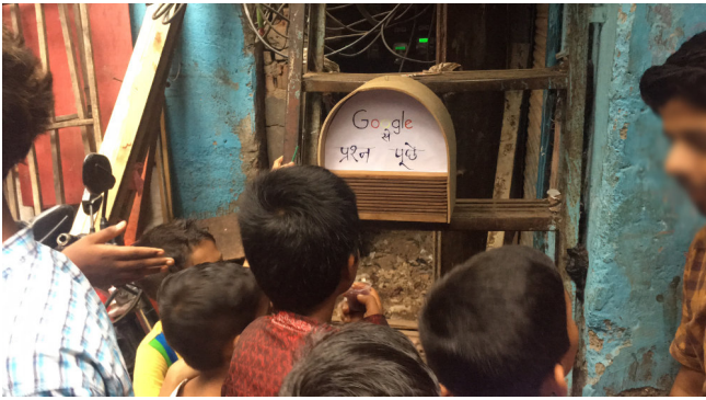
Figure 3. The prototype during the Dharavi street deployment. passers-by approach and ask a question, and receive a spoken response.

explaining how their feedback during the initial workshops had helped lead to the design. This was followed with a short demonstration of the probe's usage by a local researcher.